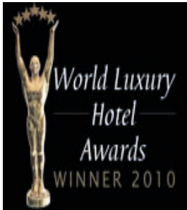
BEST LUXURY COASTAL HOTEL