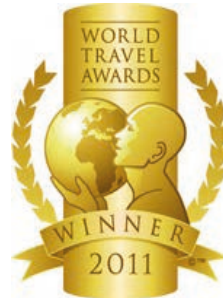
WTA – Turkey's Leading Golf Resort