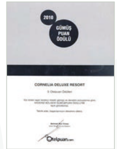
OTEL PUAN – SILVER AWARD