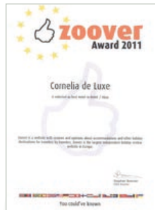
ZOOVER – BEST HOTEL BELEK