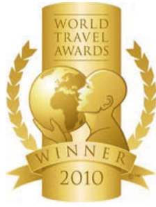
WTA – Europe's Leading Golf Resort